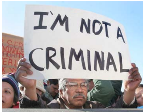
Local and national rallies target immigration issues.

Together We Make a Difference Through Shared Ministry Apportionments!