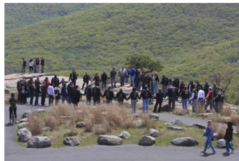
Bikers gathered for prayer at the top of Perkins Drive at Bear Mountain Park.