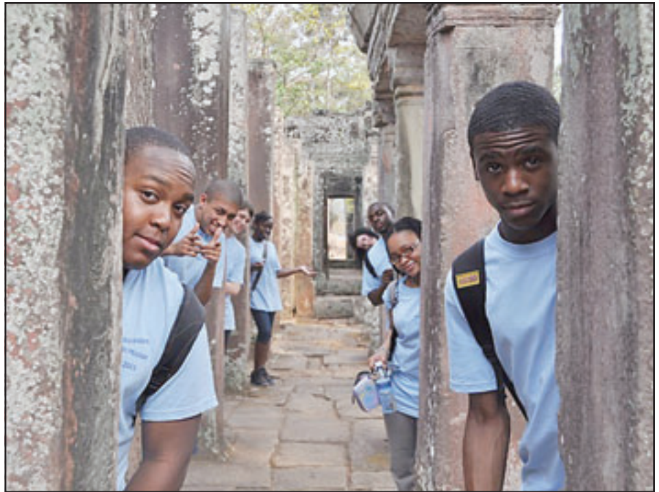
The agenda included time for stops at cultural and historical sites.