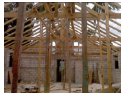
ABOVE: Much progress had been made on the church rafters by the last day. LEFT: Sunday was a day for church and rest.

Lord willing, we will raise the rafters tomorrow or Wednesday morning. We all agreed to work an extra half-day on Wednesday.