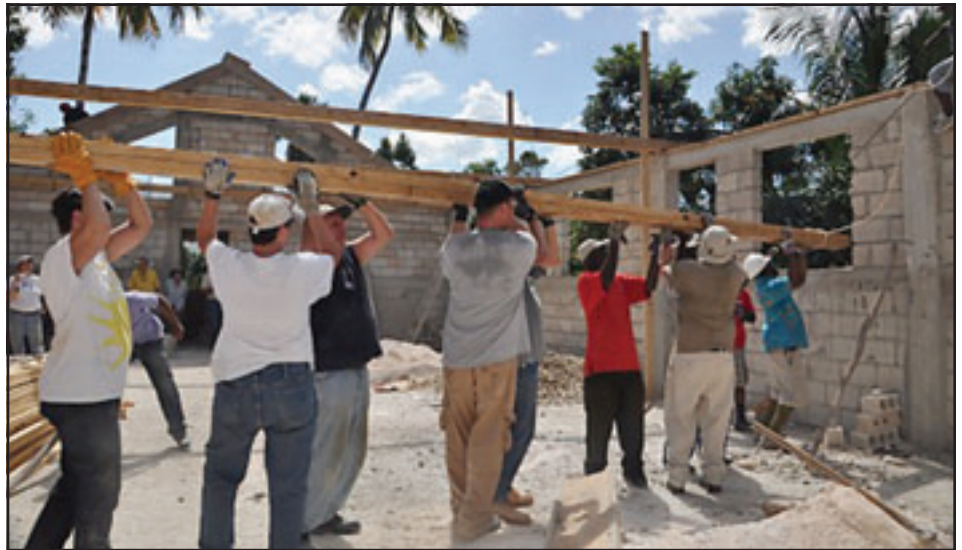
The team helps hoists a beam in place to support the rafters.

Today was an awesome day. It started with the sun in full blossom and clear blue sky. Things started out slowly but once we got going, we cranked! We completed the block walls, installed the sill plate and installed the crossbeams.