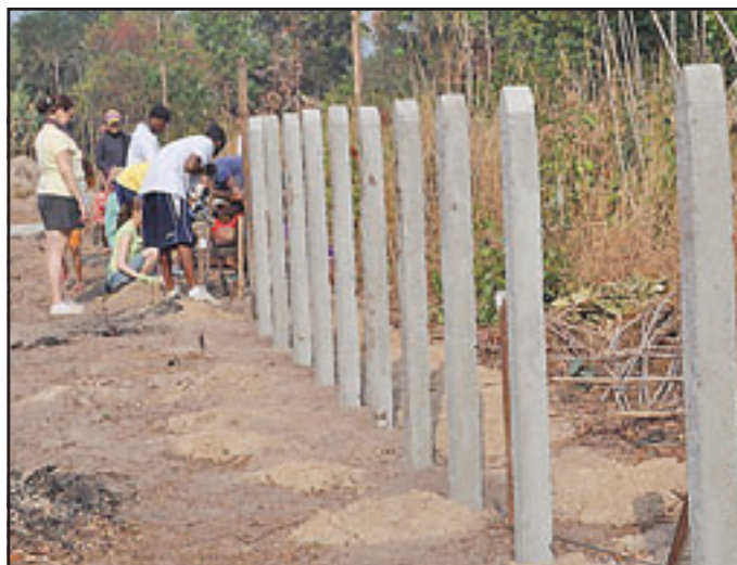
ABOVE LEFT: Pipe cleaners spurred the creativity of the village children. ABOVE RIGHT: Rev. Joseph Ewoodzie pitches in to lighten the load. LEFT: The lineup of fence posts is a sign of steady progress.