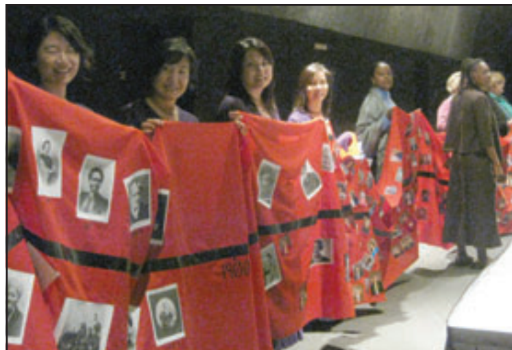
A timeline created on red fabric, below, honors the women of the UMC, both past and present.

For the complete story, go to: http://www.umc.org/site/apps/lnet/content3.aspx?c=1wL4KnN1LtH&b=5259669&ct=9126851 .