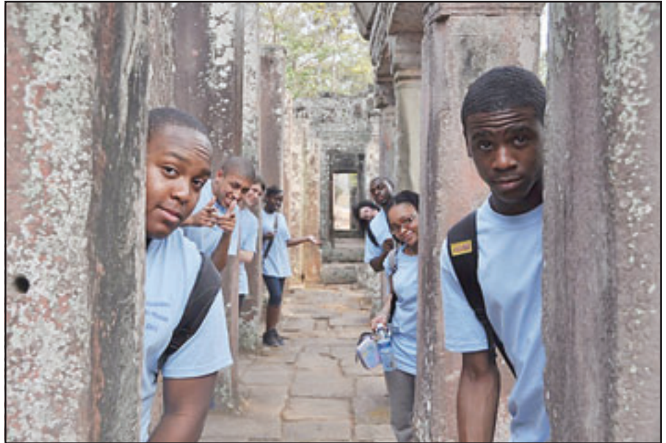
The agenda included time for stops at cultural and historical sites.

As we were preparing to leave for the school, we realized that some of the children who were supposed to be in school had come to the site to