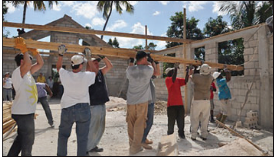
The team helps hoists a beam in place to support the rafters.

I can't end without mentioning the children. There are between 30 to 50 of them around. They love to play with us, and we love to play with them.