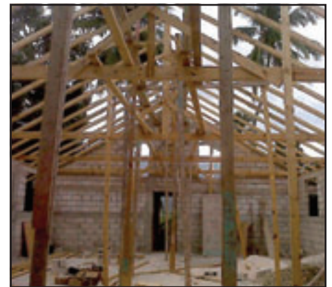
ABOVE: Much progress had been made on the church rafters by the last day. LEFT: Sunday was a day for church and rest.

I know this blog has been going for a couple of days and if you are moved to do something, I suggest you pray to take the training course and come here for a week. There will be group coming here for a week. There will be a group coming here once a month for the next 3 years. Your life will be changed forever. Thank you all for your prayers, and may God bless you.