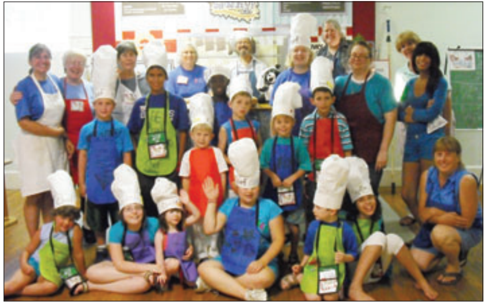
Some of the 14 children and 26 volunteers, above, at the New Paltz UMC gather in front of the "Shake It Up Café" set that was on loan from the conference's VBS on the Road program. Below, two of the VBS "chefs" prepare to serve up food they made for The Caring Hands Soup Kitchen at the Clinton Ave. UMC in Kingston.

VBS was a success. The kids really enjoyed their time with us. But beyond that, they did meaningful work—making food to feed the hungry. We found some of the older kids studying the faces of the photo display, wanting to know more about the people before them. Rev. Kelley visited with us on Wednesday night, and invited everyone to come the following