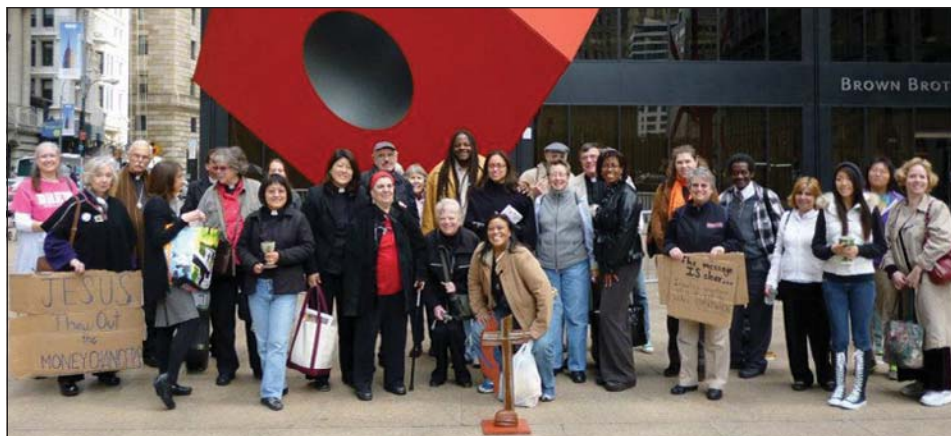
Some of the United Methodists who gathered to offer their support and care to the protesters.

The "United Methodists at OWS" service on October 23 was held in solidarity with the protesters' emphasis on economic justice while also standing in a spirit of reconciliation. The Wall Street occupation is described as representing the 99% of Americans who are struggling during the nation's economic crisis while the wealthiest 1% have more than doubled their share of income in the United States. Leading up to the gathering, United Methodists engaged in online dialog about Jesus and the 99%. Being intentional to not vilify people, the invitation for the United Methodist gathering said, "We are the people of the United Methodist