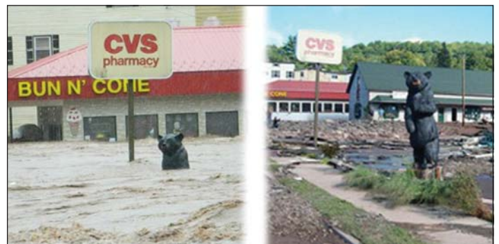
This carving of a black bear that survived the floodwaters left by Hurricane Irene is symbolic of the spirit of the people who live in the Catskills.