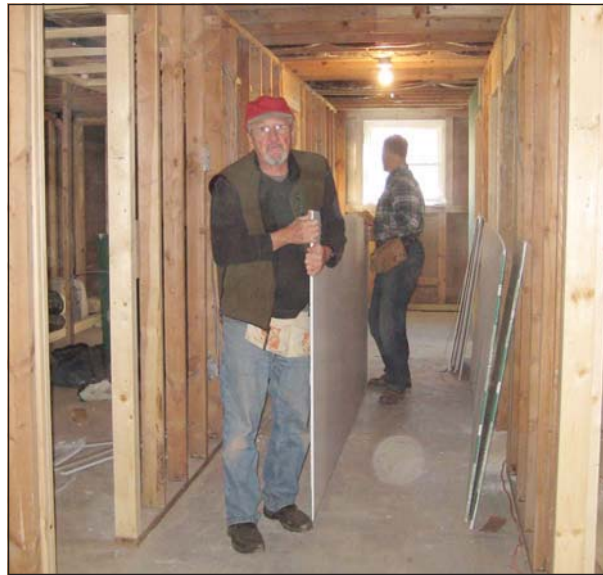
Work goes on both inside and out as a team from Valhalla UMC repairs a home in Prattsville, N.Y..

As of November 8, $164,210 has been raised, with $59,210 coming from NYAC churches and communities. (This amount does not include the $100,000 UMCOR grant.) While many have been very generous, the need is still great. Congregations and individuals across the conference