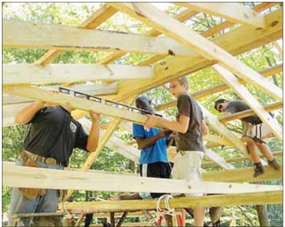
The roof goes up over the “access-friendly” tent platform at Kingswood.