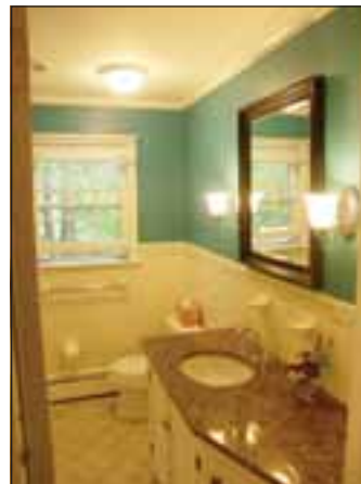
Before and after photos of the bathroom renovation in the second parsonage.