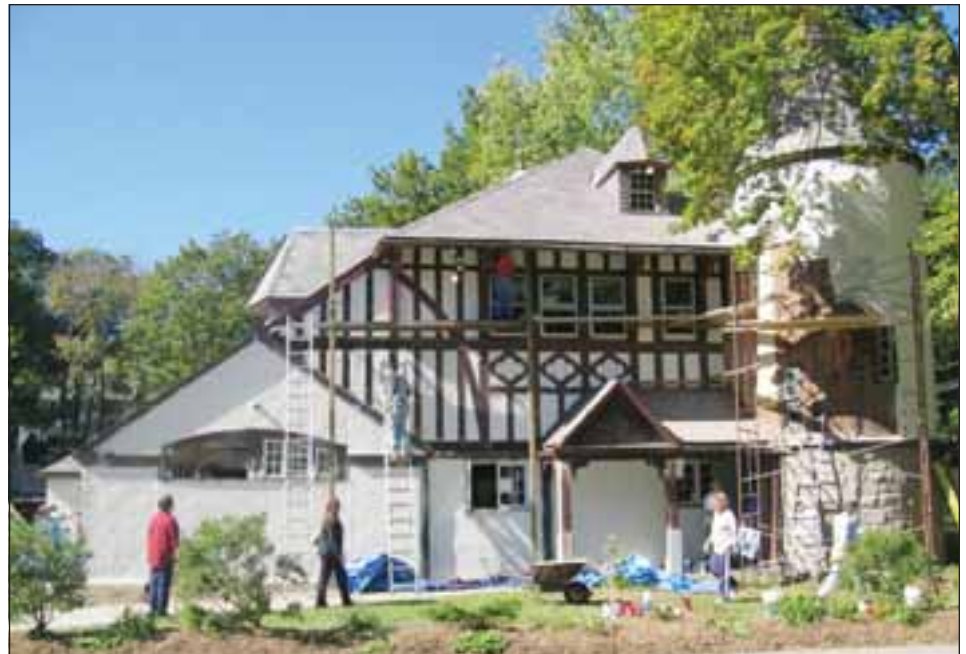
Exterior renovations on the carriage house in October 2008 were the first work project.