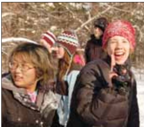
The youth bundled up against the bitter cold for some outdoor fun.