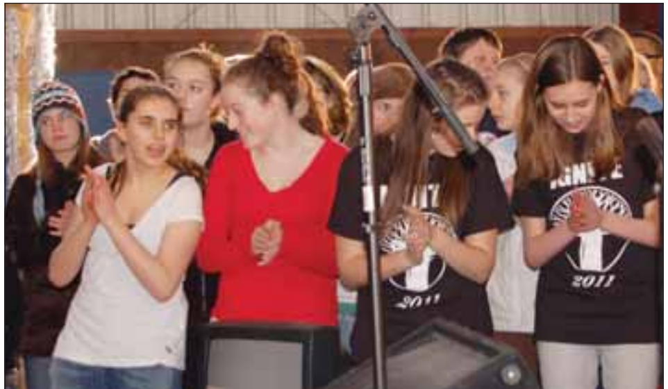
The singing was joyful, above, and the discussions thought-provoking, below, for the 336 participants at Ignite.