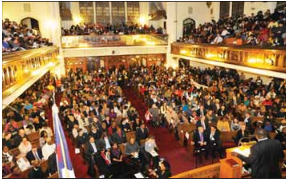
The sanctuary at Convent Ave. Baptist Church was filled beyond capacity for a multi-faith service in support of fair wages for New Yorkers.

“Now is the time to make an adequate income a reality for all God’s Children. Now is the time for city hall to take a position for that which is just and honest.”