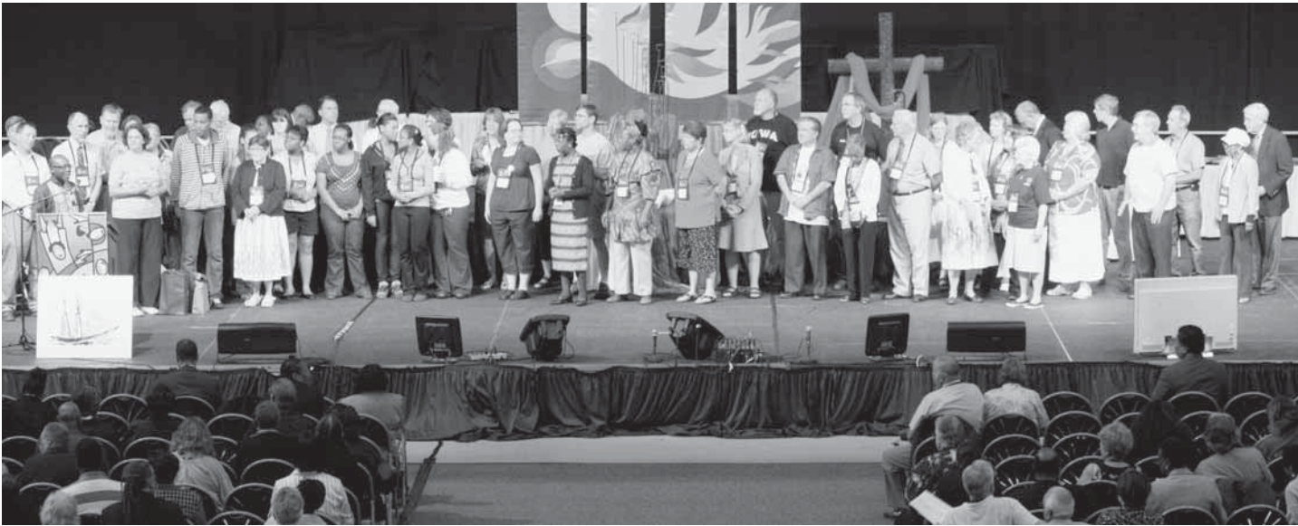
2009 - New York Annual Conference