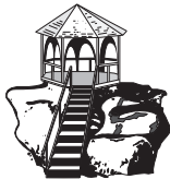
Quinipet Camp & Retreat Center Shelter Island Heights, NY