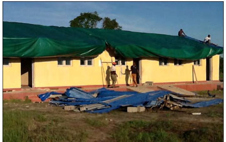
Tarps are placed over a damaged roof at the Dondo House for Children in Mozambique.

children safe from the sun and rain until permanent repairs can be made.