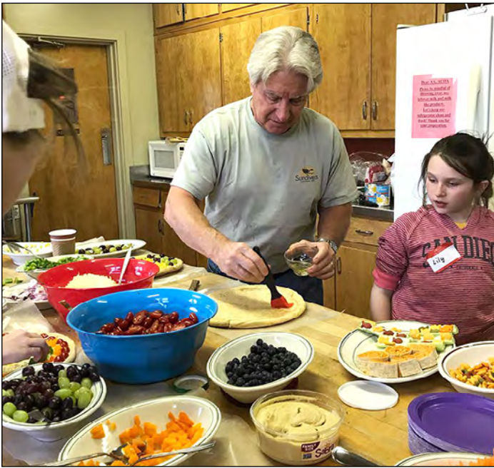
ABOVE: Learning to make vegetable pizzas at Huntington-Cold Spring Harbor UMC; RIGHT: a warm welcome at Tremont UMC.