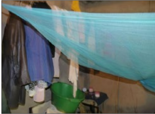
ABOVE: A blue bed net in use in one of the homes. RIGHT: It is common to see young children caring for even younger ones.

This was one of the surprises on our trip. I asked to see this site in Chimoio, but did not realize that we would be visiting a sort of orphanage. Habitat for Humanity International supported a project that built several three-room brick houses for women, who are in their fifties and sixties and caring for three or four children. These women were without families and were grateful for the opportunity to live in the homes, raise their own food and share it with the orphans. There is a well for water, but no electricity. Brick outhouses bring a measure