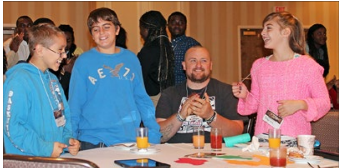
ABOVE: Some of the youngest participants get a round of applause from the group.

Agtarap addressed the relationship between the changing communication landscape and