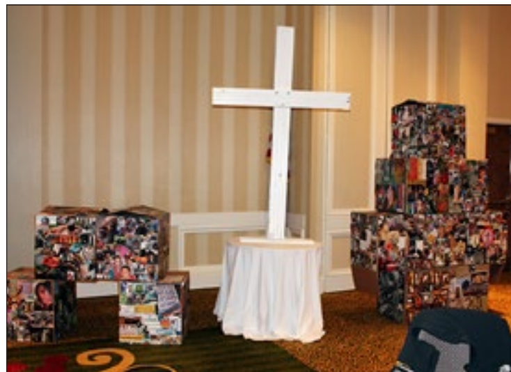
LEFT: Cardboard boxes decoupage with faces and words stacked up to form the altar for the event.