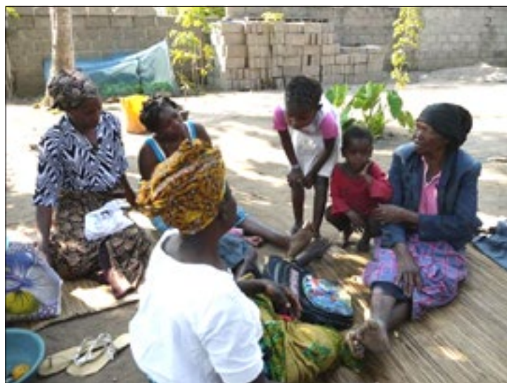
Village women graciously opened their homes for a tour.

It is my dream that you will join us by extending your hand in Christian love and help our brothers and sisters in Christ to reach their goals of feeding the hungry, bringing clean water to those who are thirsty, welcoming strangers to know Christ, giving clothes and hope to those afflicted with AIDS, and helping those who see prostitution as their only source of income to learn the skills needed to support